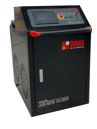
Fiber Laser Welding Machine with Three Functions: Welding, Cutting, and Cleaning [FLM-2000W]