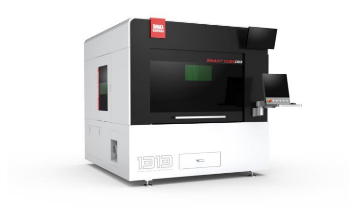
Compact Fiber Laser Processing Machine with Outstanding Cost Performance [SMART CUBE]