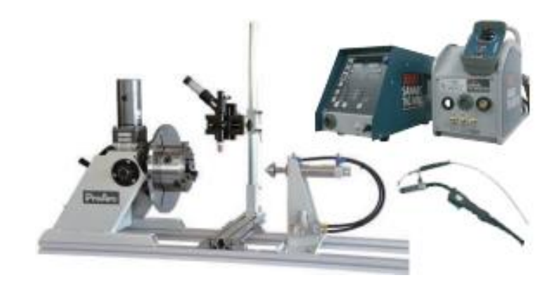
High-Efficiency Semi-Automatic TIG Welding System [Sanarc TIG Meister] Equipped Rotating Pipe Welding System Package