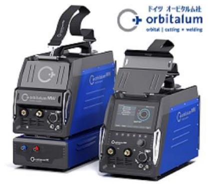
Orbitalum Automatic Pipe Welding Machines for High-Purity Pipe Welding in Semiconductor and Other Fields

In welding system engineering, we leverage our proprietary technologies to propose integrated system packages that incorporate peripheral equipment to address customer challenges. We can also offer collaborative robots and various other automation solutions.