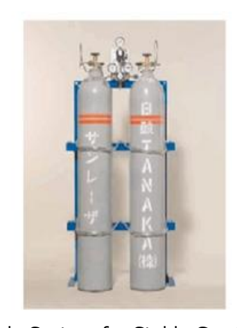
Laser Gas Supply System for Stable Gas Supply to CO<sub>2</sub> Laser Cutting Machines

Hydrogen gas cutting significantly reduces CO<sub>2</sub> emissions and fuel gas consumption, making it an essential solution for a carbon-neutral society. We conduct on-site demonstrations.