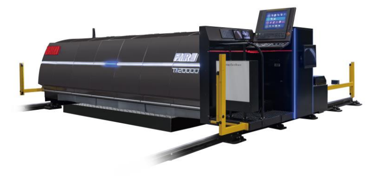
The latest fiber laser cutting machine "The All-New" that revolutionizes cutting [FMRIII]

With sales offices in China and the U.S., we are expanding our sales activities in Korea, the U.S., and the Southeast Asian region, focusing on laser cutting machines.